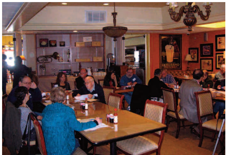
CPT Seminar attendees at West L.A. Grill