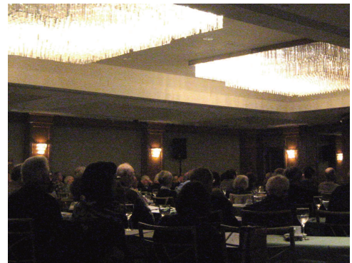
A large attendance at the highly successful meeting.