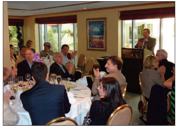
An appreciative audience.